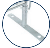
Photo-quality custom made fence screen for signage & advertising