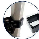
Side Rail H / Side Rail S