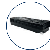
Heavy Duty Tent Case