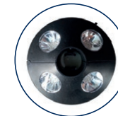
LED Tent Light