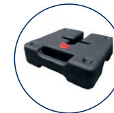
Plastic Water Base (8 L)