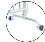
Sliding Wheel Base